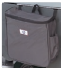
Onboard tote bag