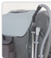
Onboard scrub-vac system

14600 21st Avenue North Plymouth, MN 55447-3408 www.advance-us.com Phone 800-850-5559 Fax 800-989-6566